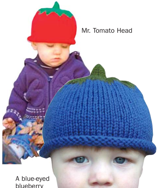
Mr. Tomato Head